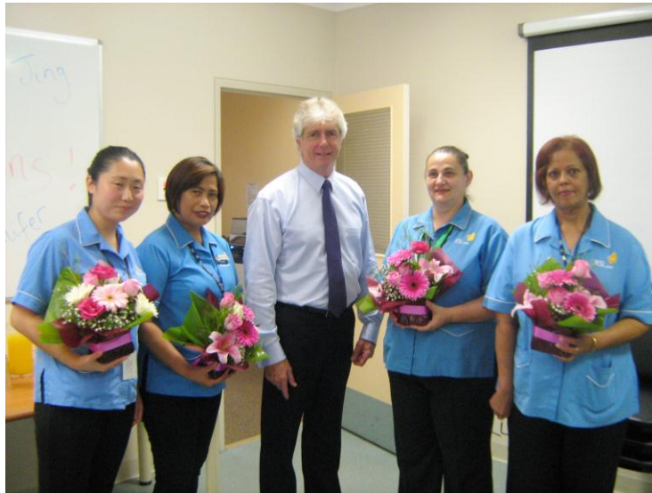
Certificate IV Awards ceremony