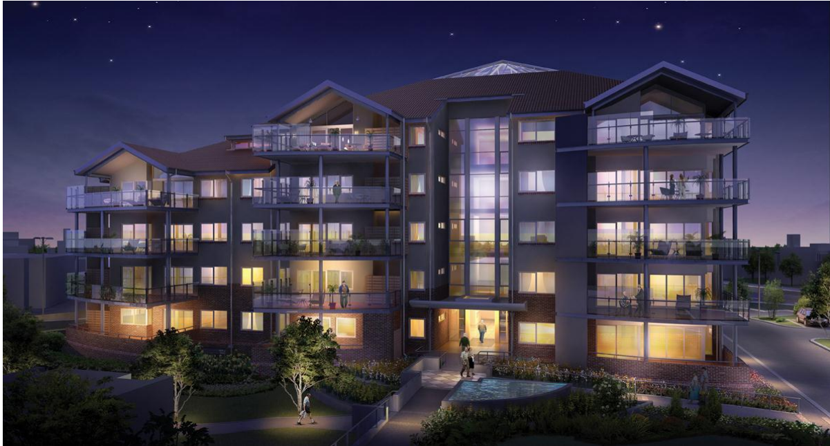
Grandview Apartments – Menora Gardens