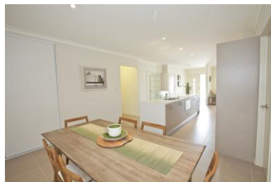
Jurien Bay Development – Stage 1