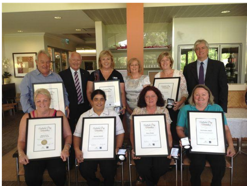
Australia Day Awards ceremony

Following the inaugural presentations in 2013, RSL Care WA presented National Australia Day Council Achievement Medallions and Certificates to members of staff during an award ceremony on Friday 24 January 2014.