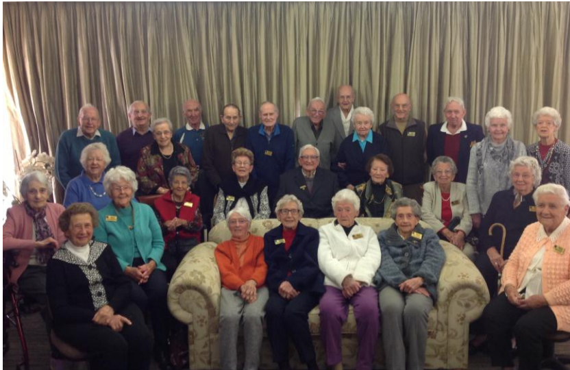
Members of the Menora Gardens & Pearson Retirement Villages 90's Club

For over a decade, RSL Care WA has recognised the demand for flexible shorter term Retirement Village accommodation being provided on a 'rental only' basis, to assist in caring and supporting the aged. The rent payable in these instances is substantially below market rental values for similar residential properties. These leasing terms provide members of the general community experiencing poverty, distress, disadvantage, financial hardship, social isolation, loneliness or in necessitous circumstance access to safe and secure independent living accommodation. Home Care services and visitation services are also available when required.