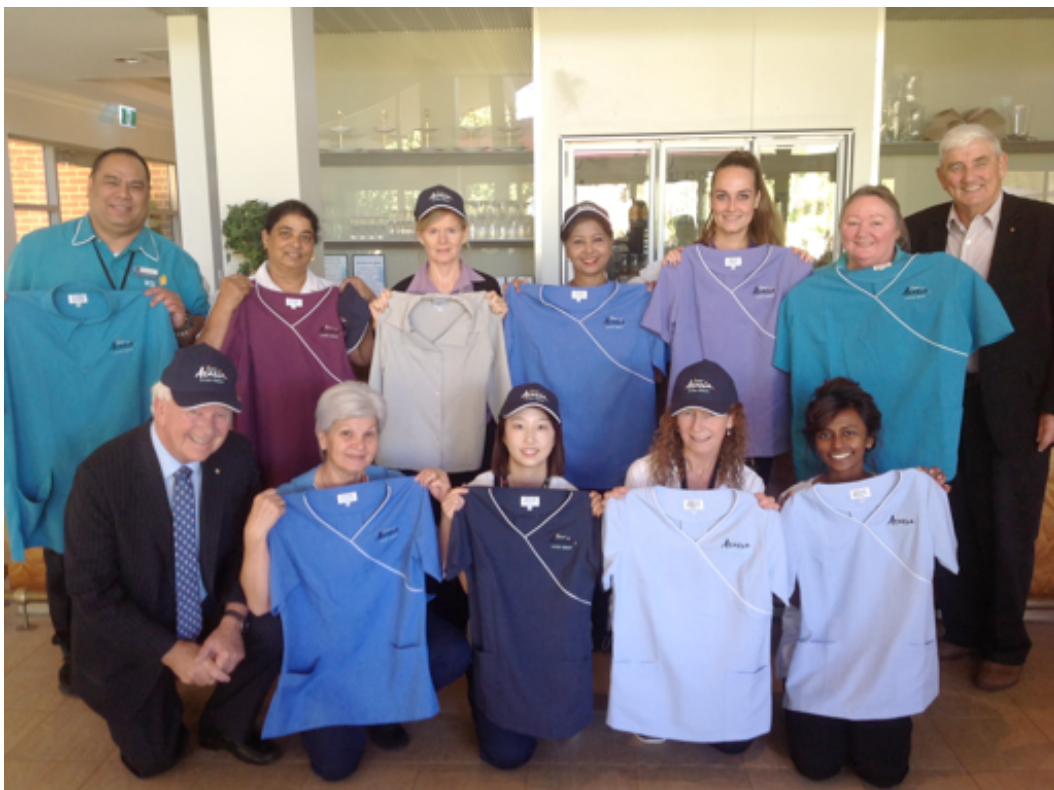
Acacia Living Group Uniform Presentation

Our thanks go to our consultants, staff, residents, and clients for their patience and understanding during the due diligence and transition to our new name and corporate logo.