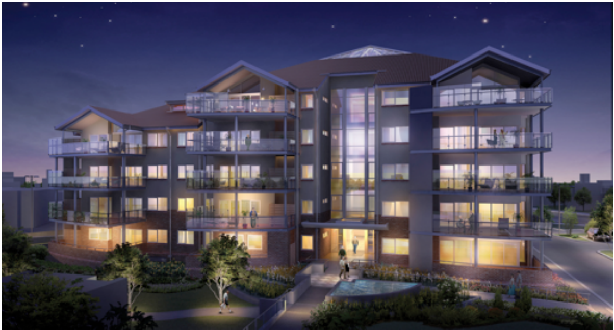
Grandview Apartments – Menora Gardens