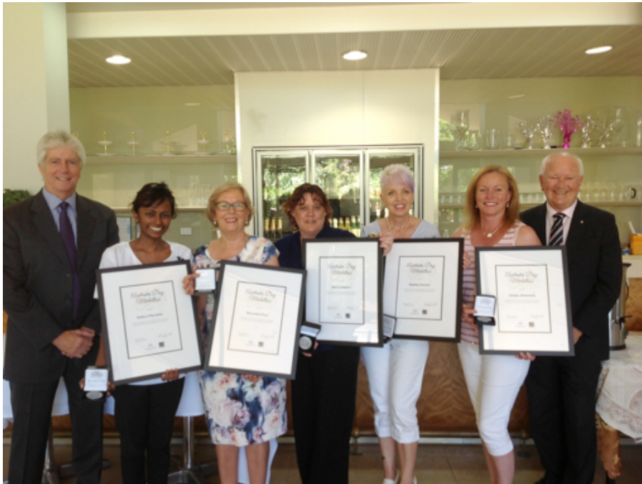
Australia Day Awards Ceremony