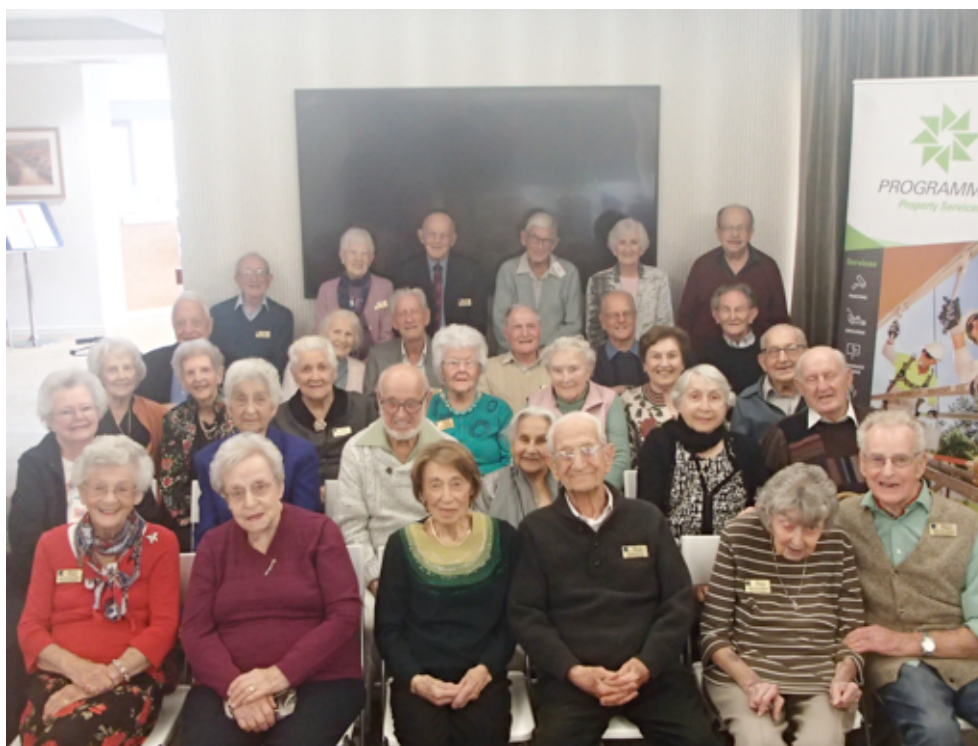
Members of the Menora Gardens & Pearson Retirement Villages 90's Club - 2018

with each village offering a variety of retirement village scheme leases or rental lease options.