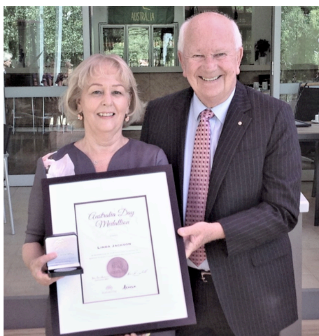
Australia Day Award Ceremony 2019

Award ceremonies are held annually to recognise significant service milestones, successful completion of training courses and to acknowledge the valuable contribution of our employees and volunteers.