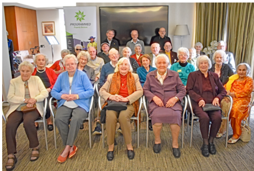
Members of the Menora Gardens & Pearson Retirement Villages 90's Club – 2019

Mandurah Village, Coral Estate Village, Menora Gardens Village, Pearson Village, Beachlands Village, and Jacaranda Gardens Village continue to perform satisfactorily in depressed market conditions, with each village offering a variety of retirement village scheme leases or rental lease options.